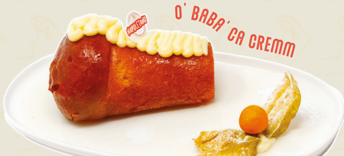
O' BABA' CA CREMM